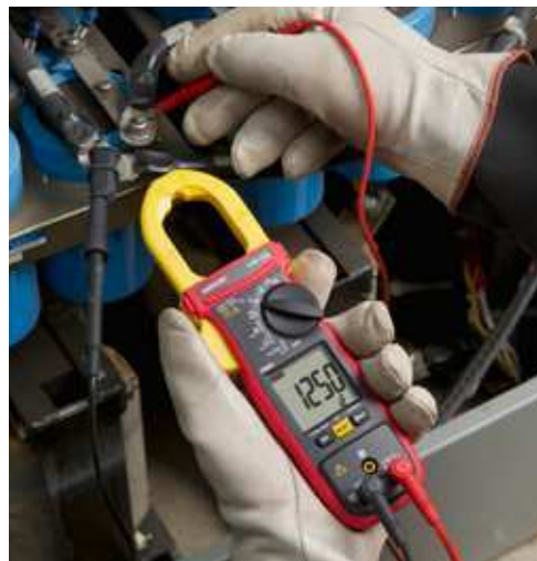
AMP-320 AC/DC Clamp Meter Electrical Motor Maintenance