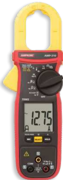
AMP-310 AC Clamp Meter HVAC