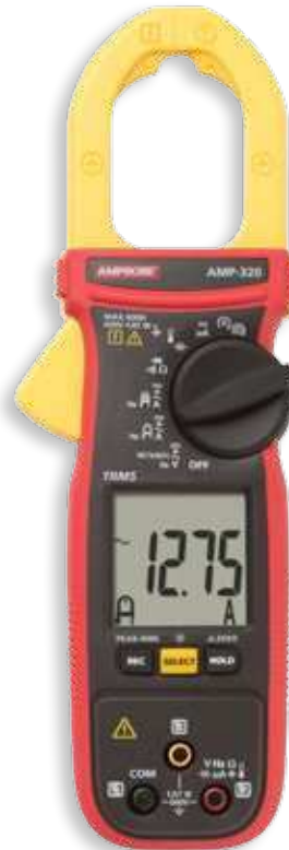
AMP-320 AC/DC Clamp Meter Electrical Motor Maintenance