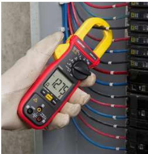
AMP-310 AC Clamp Meter HVAC