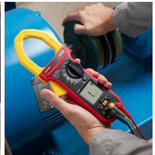
AMP-330 AC/DC 1000 A Clamp Meter Industrial Motor Maintenance