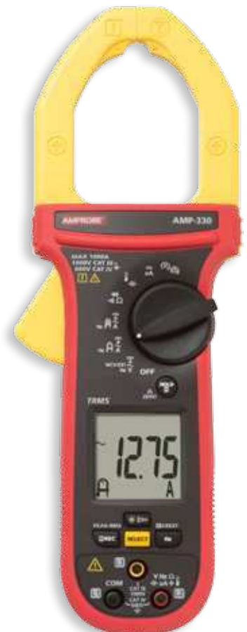
AMP-330 AC/DC 1000 A Clamp Meter Industrial Motor Maintenance